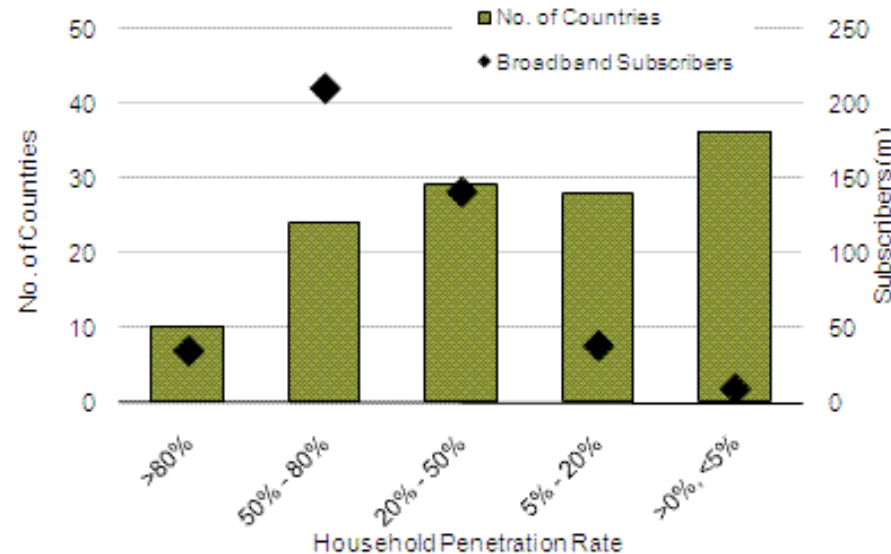
Broadband Subscriber Distribution by Household Penetration Rate, Q1 2009